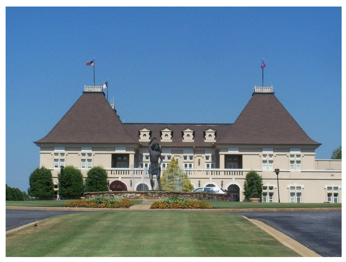
Click here to register for the Fall Golf Classic which will be held on October 14th.