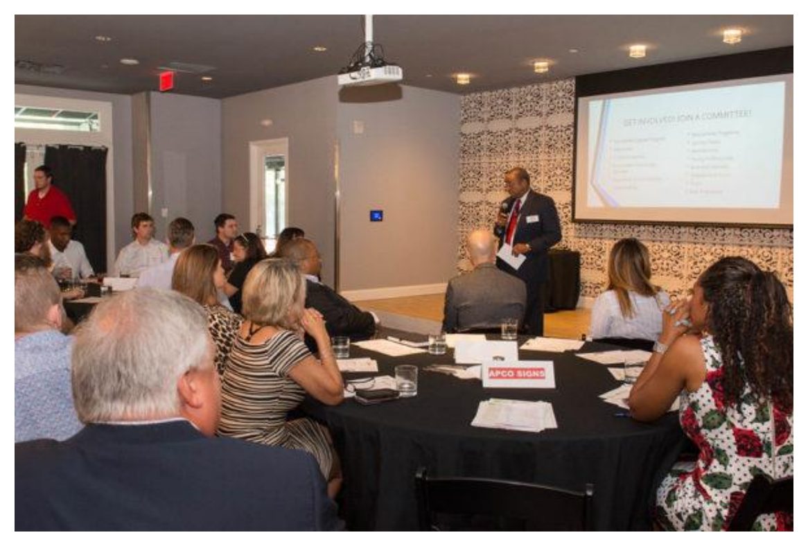
Click on the image above to see more pictures from October Membership Meeting that was held at 5Church Atlanta.