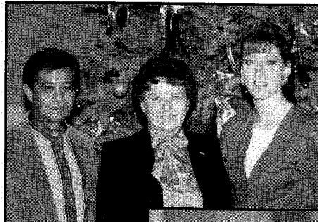
New members in December 1990.