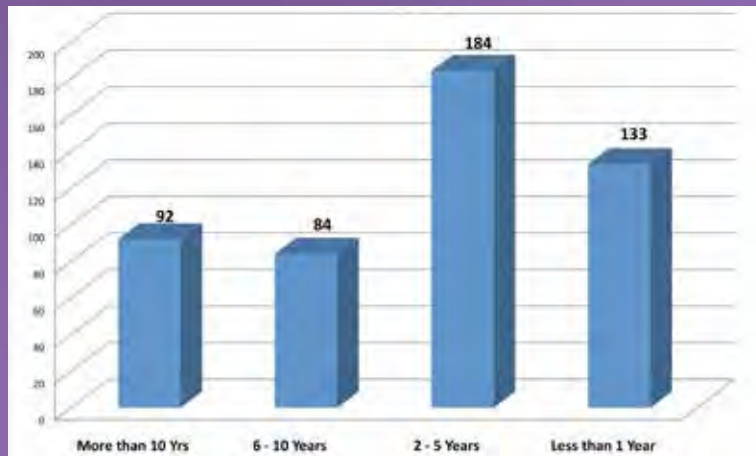
Membership by Tenure