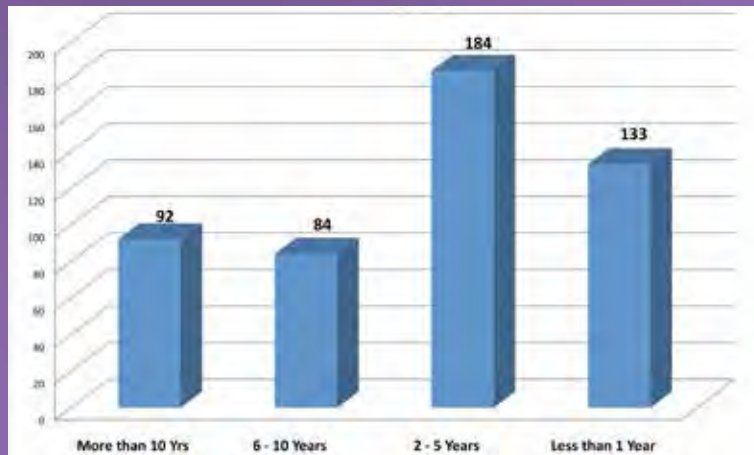
Membership by Tenure