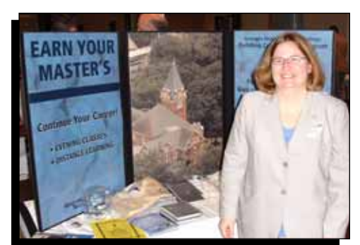
CFM CFM CFM earn your CFM!