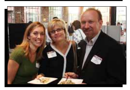
What a fabulous looking group!