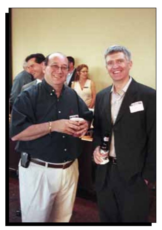
Coffee is GOOOD --beer is better!