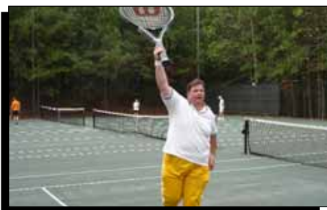
Living Large!! (extra, extra, extra large)