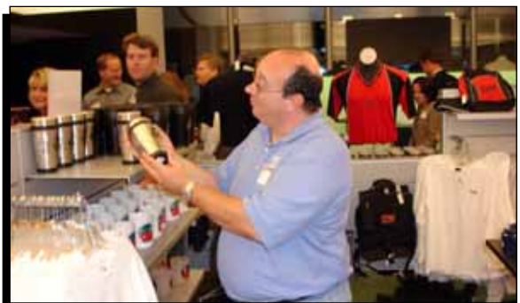
Of course, no tour is complete with out a lovely souvenir.