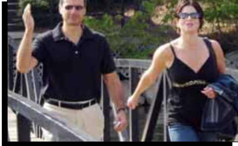
Is the royal yacht ready? Their majesties have arrived.