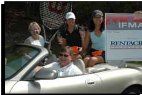
Pimp my Tennis!