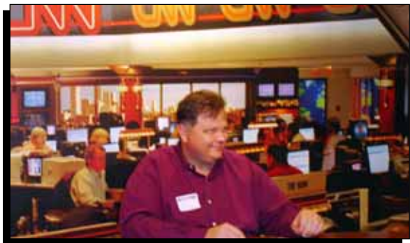
"...and that's news to me."