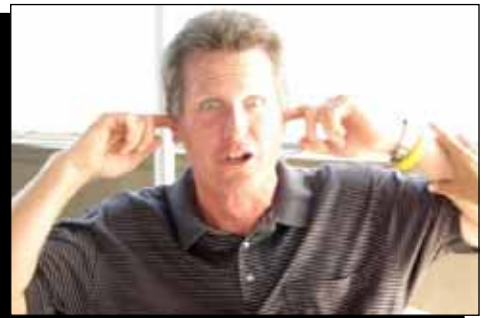
Im not listening! Im not listening! La, la, la.