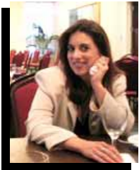
Glass half empty.....Glass half Full .....Glass all empty