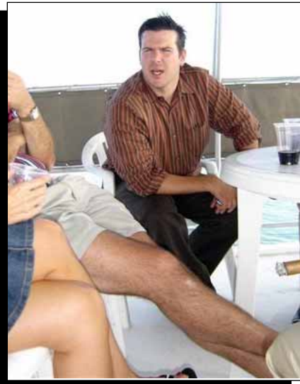
I said, NICE LEGS!!