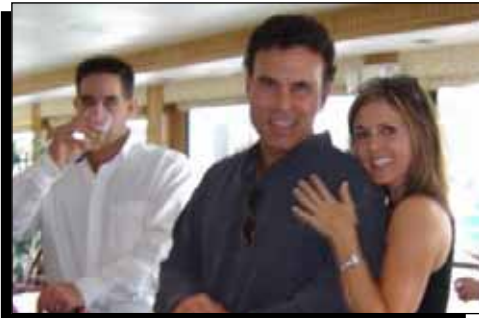
Hey bartender, I'll have what he's having.