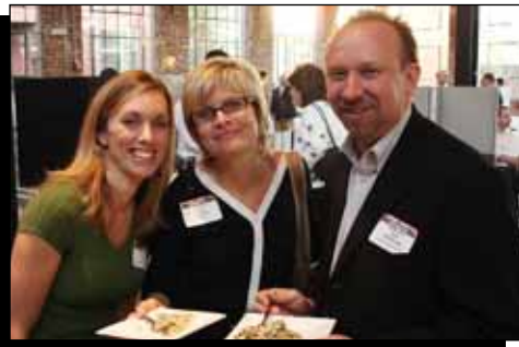
What a fabulous looking group!