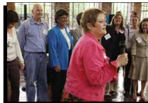
Community Service Announcement.