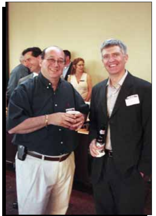
Coffee is GOOOD --beer is better!