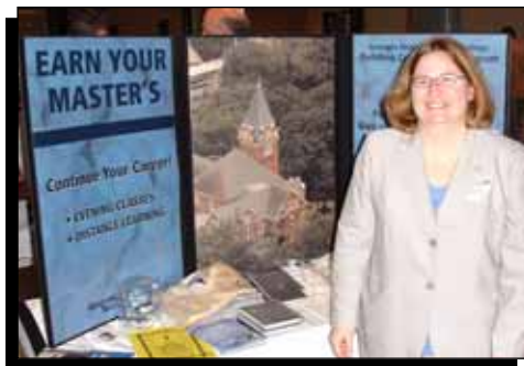
CFM CFM CFM earn your CFM!