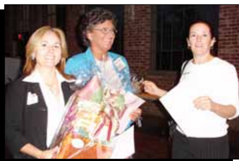
Tell us what you won !!!