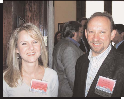
Smile, it makes people wonder what you're up to.