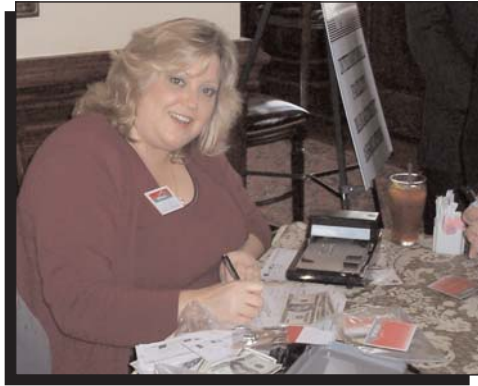
SHOW ME THE MONEY!!!