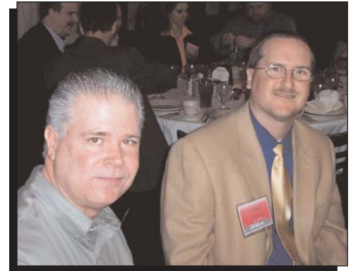
Are we having fun yet?