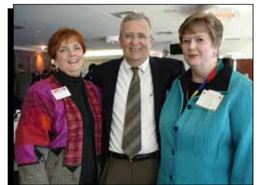
Look out 2006, here we come.