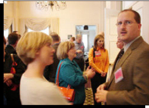
Was I talking to you?