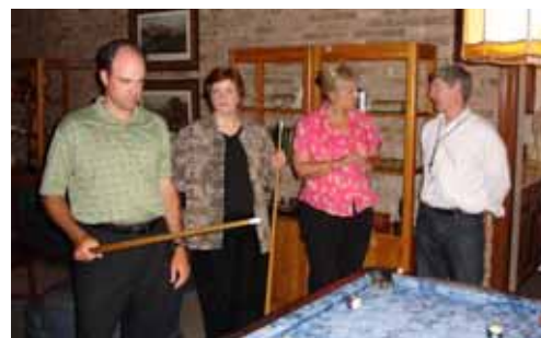
Taking a BREAK at the Board Meeting.

Send your Member Profile and Photo to ifmanews@rentacrate.com or fax to 678-547-0132.