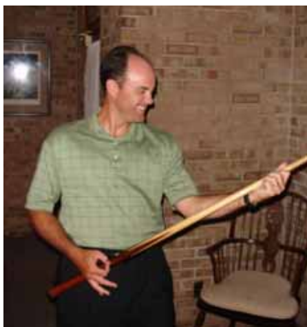
Air Head Guitar!