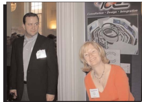
Somebody cut her off, she's having way to much fun.