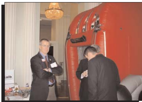
Stop pouting, your turn is next!