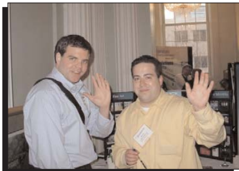
How many beers have you had apiece?