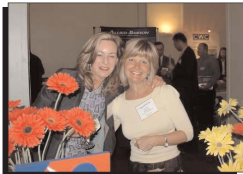
Having a blooming good time!