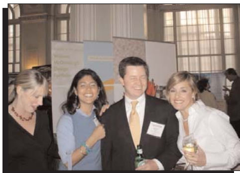
What cologne is he wearing?