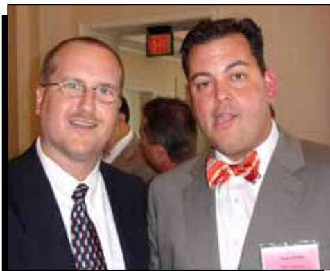
IFMA's dapper duo.